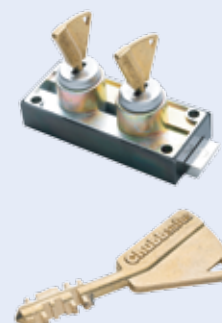
Dual control Lock with 2 key Locks