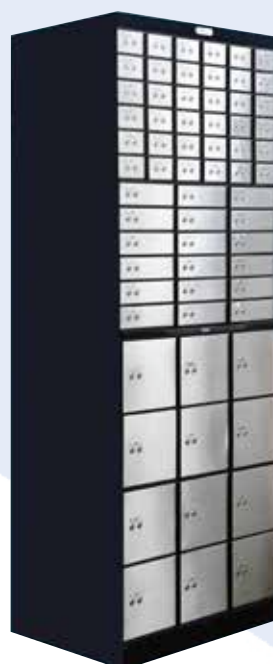
A group of 4 sections of Locker with Accessories

Within each group of lockers, the numbers commonly start at the top left corner and run horizontally in rows to the bottom right corner. Other numbering systems can also be accommodated.