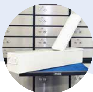
Pull Out Shelf & Inner Container

All lockers are supplied with a steel inner container. These come standard with a hasp and staple to accept the renter's own padlock.